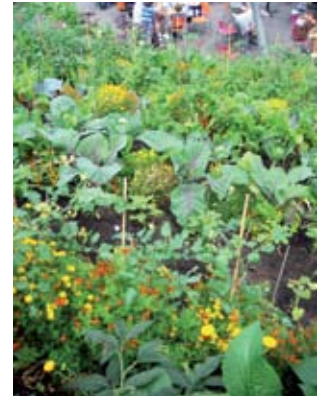
Edible landscaping at the Eden Project