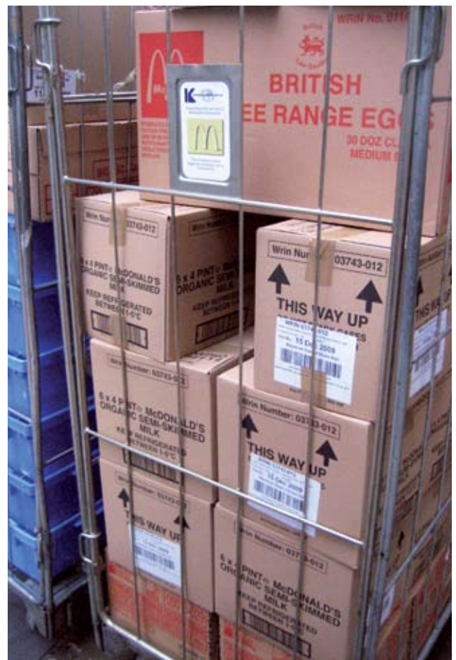
Sustainable sourcing by McDonalds