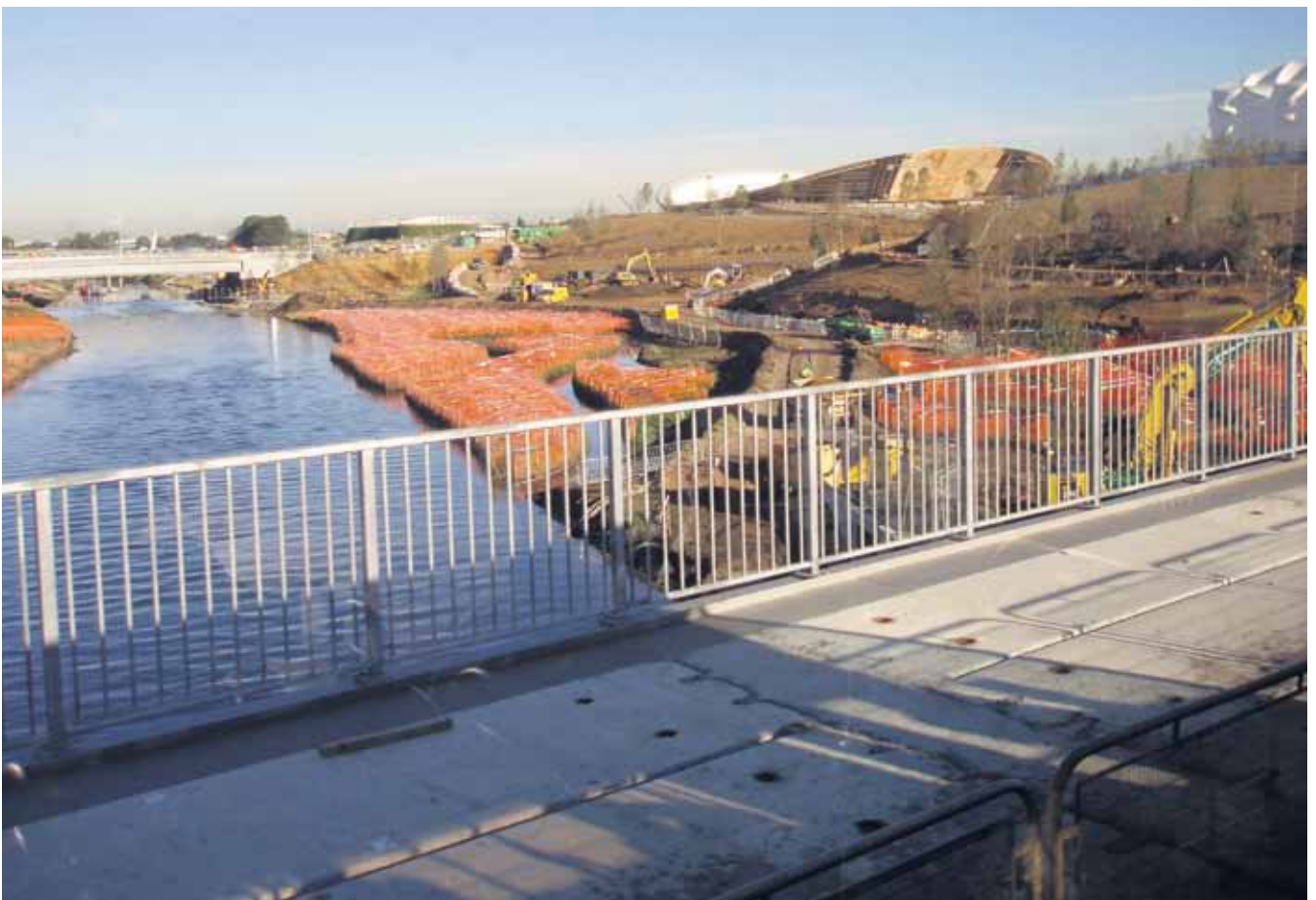
New wetland habitat being created and sustainably sourced timber cladding the Velodrome.