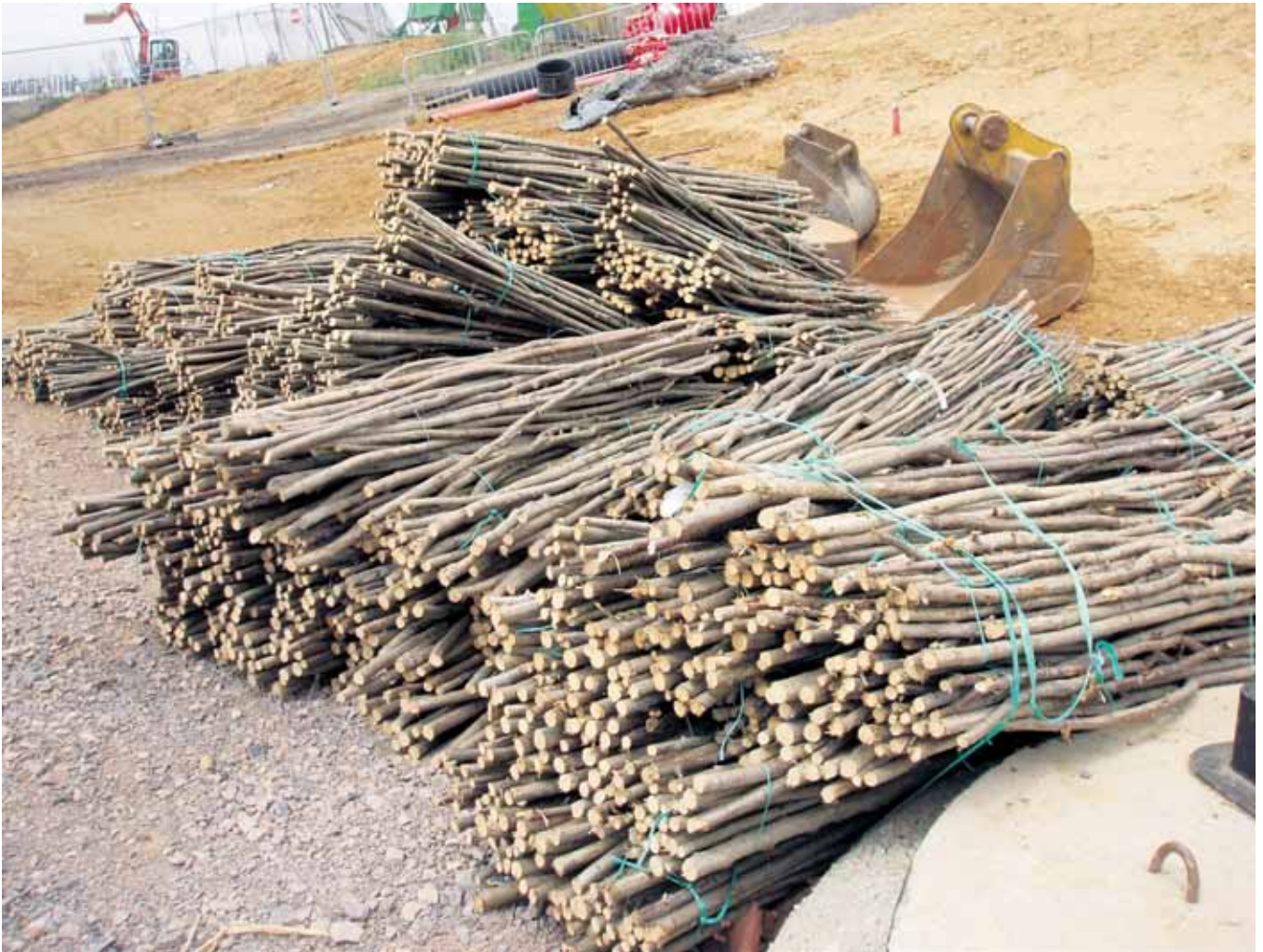
Sustainably sourced timber for use on the Olympic Park.

and assure the timber used on site and are currently seeking to obtain project certification for the vertical build phase of the project.