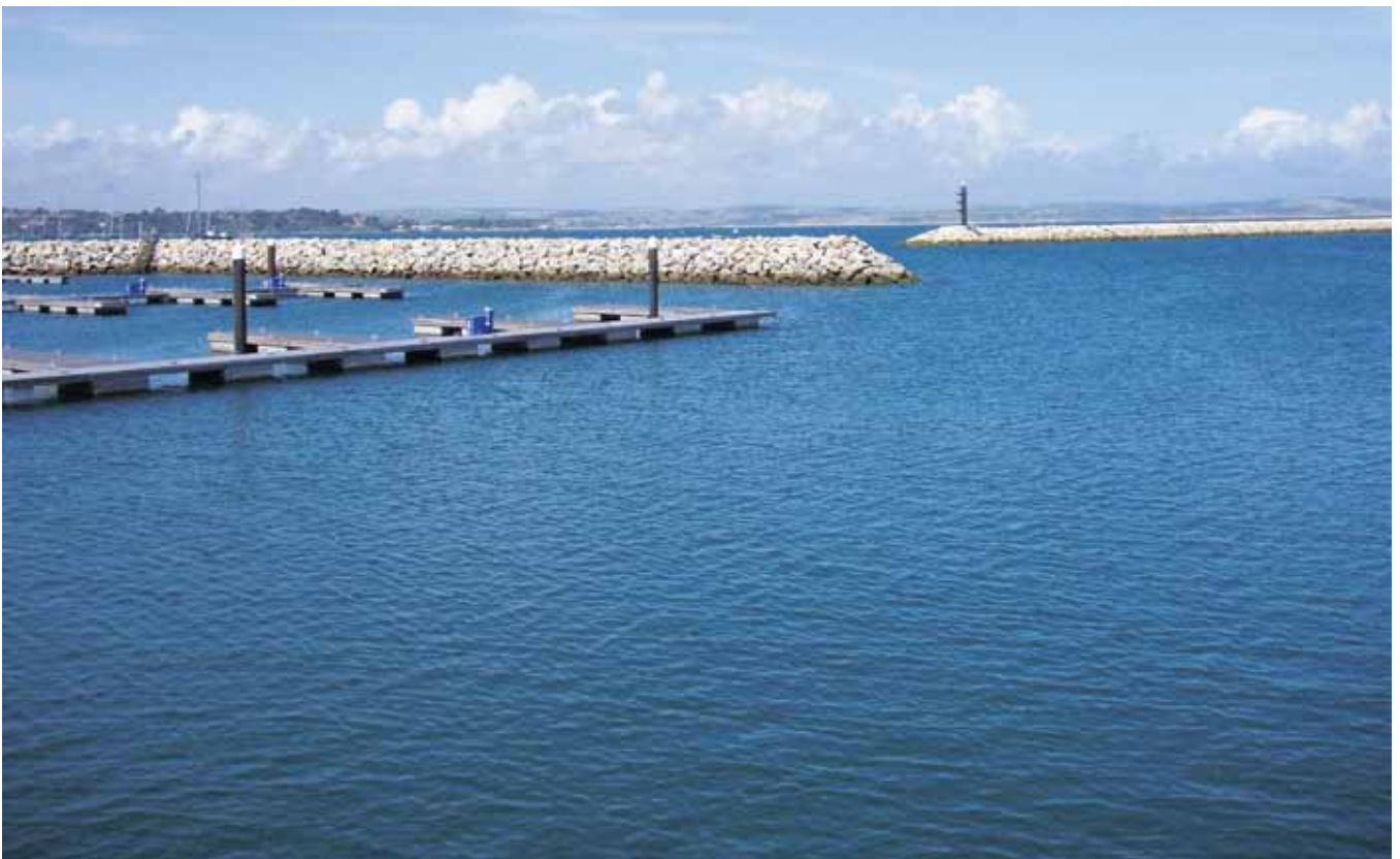
The sailing venue at Weymouth and Portland.

19.12 The sailing venue at Weymouth and Portland has a number of ecological implications. The marine environment where the course will be set up will need to be carefully managed, along with the coastal cliff top environment and other coastal land areas. The marine area is expected to become part of a new Marine Special Area of Conservation (Portland to Studland Reefs). LOCOG is liaising with Natural England and the Dorset Wildlife Trust on the ecological implications and is looking to work with them in designing the course