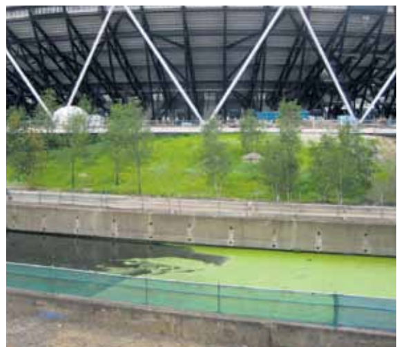
New habitat and problems with duckweed.