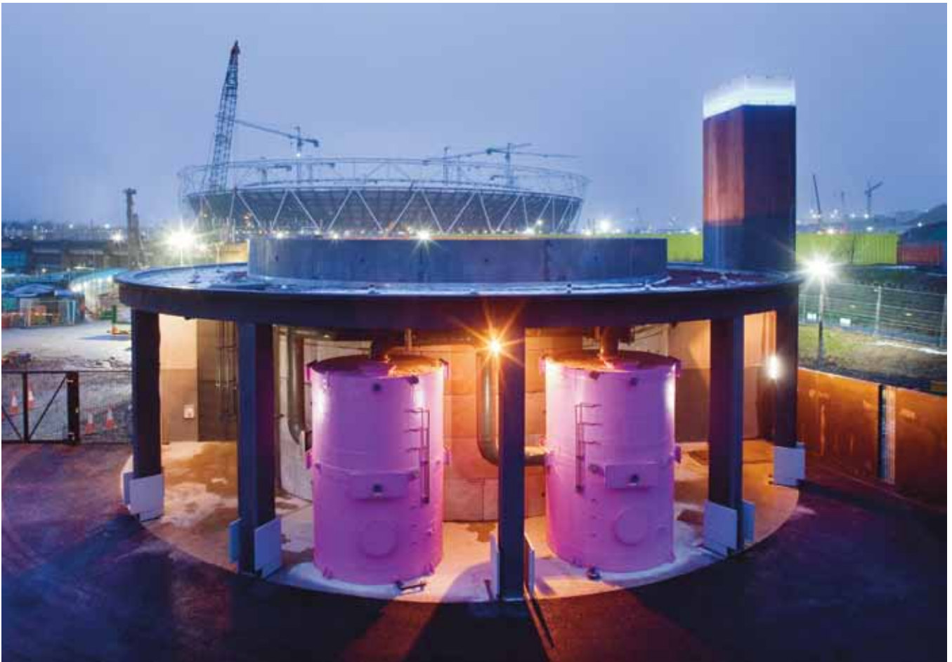
Pumping station and new sewer network.