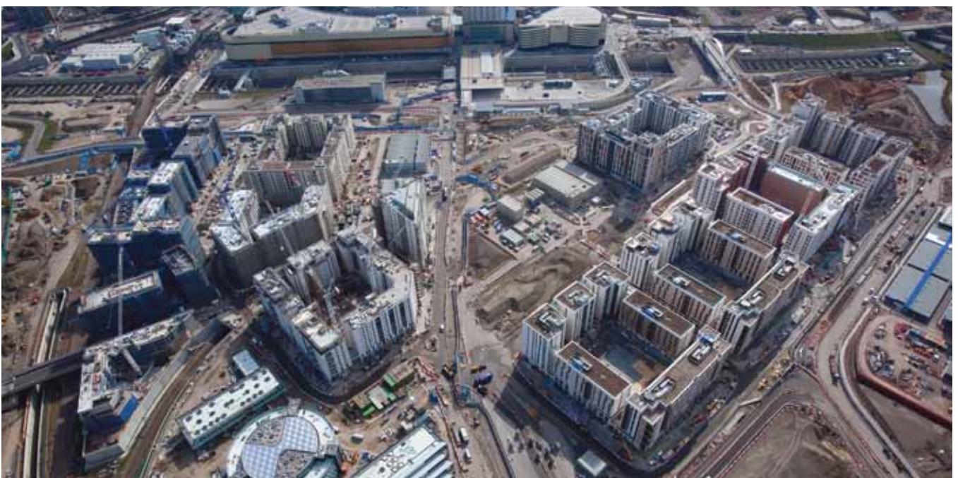
The Athletes Village.

13.2 There are a number of public commitments to learning legacy but a significant amount of work is being carried out to support this objective that is not subject to a public commitment.