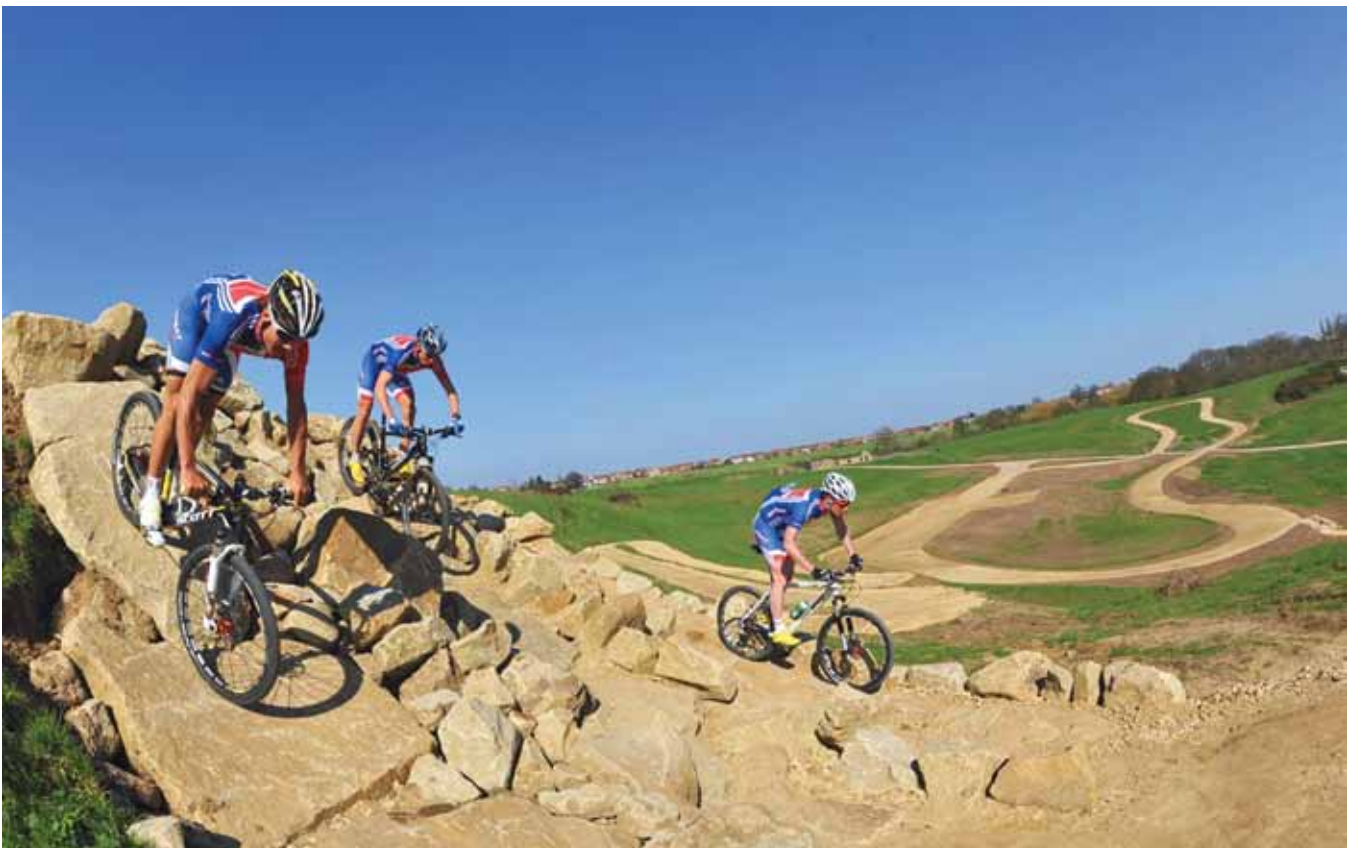
The mountain bike course at Hadleigh Farm, Essex.