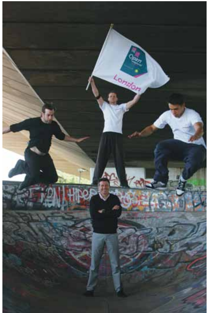
Seb Coe with freerunners Parkour UK.

6.32 In 2008, we recommended that “All users of the London 2012 Brand should be required to demonstrate how they will contribute to the London 2012 Sustainability Plan and relevant objectives” . This point was re-iterated in our review of LOCOG procurement. We have evidence of this happening through the procurement and commercial processes, through functional sustainability targets and with partners such as existing venue operators. The cultural Olympiad programme has shown good progress and there is strong evidence that sponsors and commercial partners are making increasing contributions to the sustainability agenda. The Olympic Broadcast Service is an agency of the IOC and has responsibility for most of the broadcast content of the Games. We are pleased to see a responsible approach to disposal of materials after the Games and an excellent student placement scheme which will see over 1,000 students offered the opportunity to have professional experience of the Games. However, the broadcast industry can be very energy intensive and we would like to see more engagement with rights holders to find ways to manage energy consumption during the Games. We would like to see more evidence of influence over visiting national teams, possibly using the work of the BPA as an example.