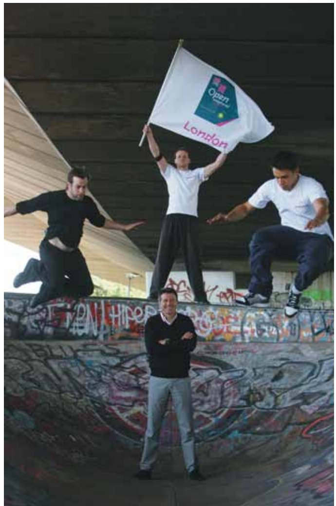
Seb Coe with freerunners Parkour UK.

6.32 In 2008, we recommended that “All users of the London 2012 Brand should be required to demonstrate how they will contribute to the London 2012 Sustainability Plan and relevant objectives” . This point was re-iterated in our review of LOCOG procurement. We have evidence of this happening through the procurement and commercial processes, through functional sustainability targets and with partners such as existing venue operators. The cultural Olympiad programme has shown good progress and there is strong evidence that sponsors and commercial partners are making increasing contributions to the sustainability agenda. The Olympic Broadcast Service is an agency of the IOC and has responsibility for most of the broadcast content of the Games. We are pleased to see a responsible approach to disposal of materials after the Games and an excellent student placement scheme which will see over 1,000 students offered the opportunity to have professional experience of the Games. However, the broadcast industry can be very energy intensive and we would like to see more engagement with rights holders to find ways to manage energy consumption during the Games. We would like to see more evidence of influence over visiting national teams, possibly using the work of the BPA as an example.