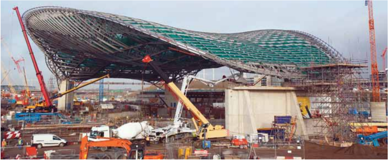
The Aquatics Centre.