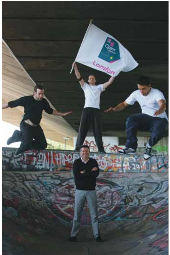
Seb Coe with freerunners Parkour UK.

6.32 In 2008, we recommended that “All users of the London 2012 Brand should be required to demonstrate how they will contribute to the London 2012 Sustainability Plan and relevant objectives” . This point was re-iterated in our review of LOCOG procurement. We have evidence of this happening through the procurement and commercial processes, through functional sustainability targets and with partners such as existing venue operators. The cultural Olympiad programme has shown good progress and there is strong evidence that sponsors and commercial partners are making increasing contributions to the sustainability agenda. The Olympic Broadcast Service is an agency of the IOC and has responsibility for most of the broadcast content of the Games. We are pleased to see a responsible approach to disposal of materials after the Games and an excellent student placement scheme which will see over 1,000 students offered the opportunity to have professional experience of the Games. However, the broadcast industry can be very energy intensive and we would like to see more engagement with rights holders to find ways to manage energy consumption during the Games. We would like to see more evidence of influence over visiting national teams, possibly using the work of the BPA as an example.