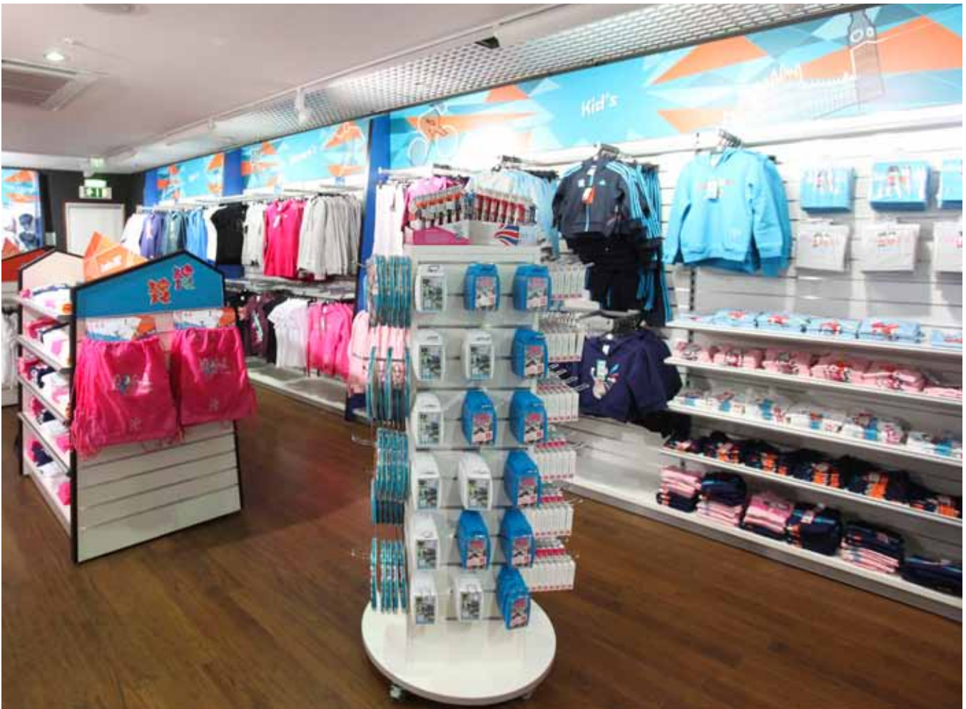
London 2012 Shop.

2.6 Merchandise is currently on sale to the public via www.london2012.com , London 2012 shops at St Pancras, Paddington and Heathrow and through retail partners Sainsbury's, John Lewis and Next. During the Games there will be shops at all venues, with approximately 80 locations comprising 100,000 sq ft. As part of this, the Olympic Park will host a 40,000 sq ft megastore. Experienced operators have been appointed to manage these shops and they are required to comply with BS 8901.